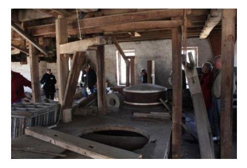
Bernheisel Mill interior

The first event of this gathering was a "meet and greet" dinner at the Pizza Grille in Carlisle, PA, Thursday evening. About 20 of us got together for dinner and conversation.