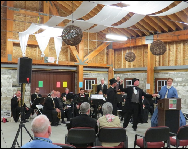
Dodworth Saxhorn Band entertains the group at the Thursday evening reception.

Oct. 23: We took the canal tour option. This was a bus ride along the course of the Clinton-Kalamazoo Canal. The canal was planned to cross the state connecting Lake Michigan and Lake St. Clair. Construction began in 1838 but ran out of money in 1843 having only reached Rochester. It was not used much if at all.