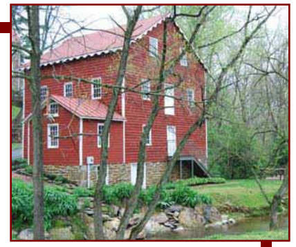
Cross Mill, York