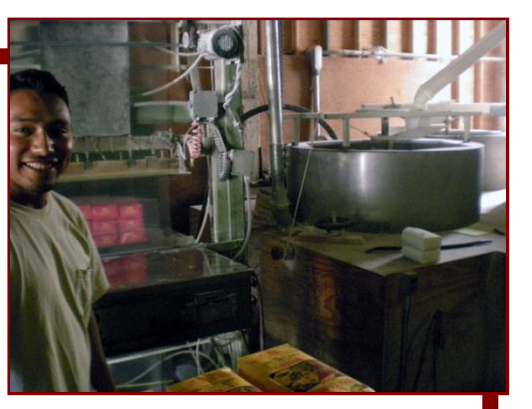
Buffaloe Mill Miller

Charles Abercombie was granted the site in 1778. In 1942 the dam was washed out and in 1973 the building collapsed. In 1973 the Friends of West Point bought the mill. Originally the mill used buhrstones to grind the grain but today a meadows mill is used. There is one run of stones in the mill today. Originally there were 32 mills on this river but only West Point remains today.